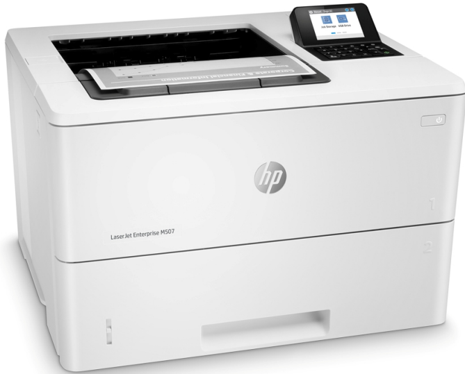
HP LaserJet Enterprise M507dn