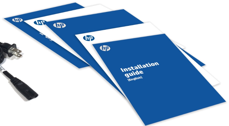
Regulatory flyer Unpack flyer Installation guide Warranty cards Support flyers