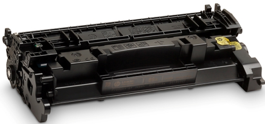
HP 89A Black LaserJet Toner Cartridge