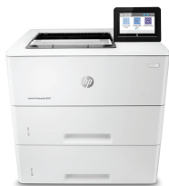
HP LaserJet Enterprise M507x