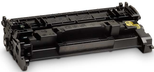
HP 89A Black LaserJet Toner Cartridge