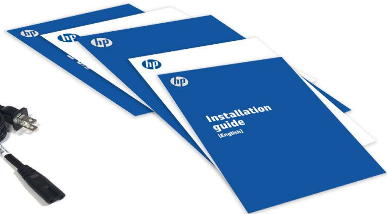
Regulatory flyer Unpack flyer Installation guide Warranty cards Support flyers