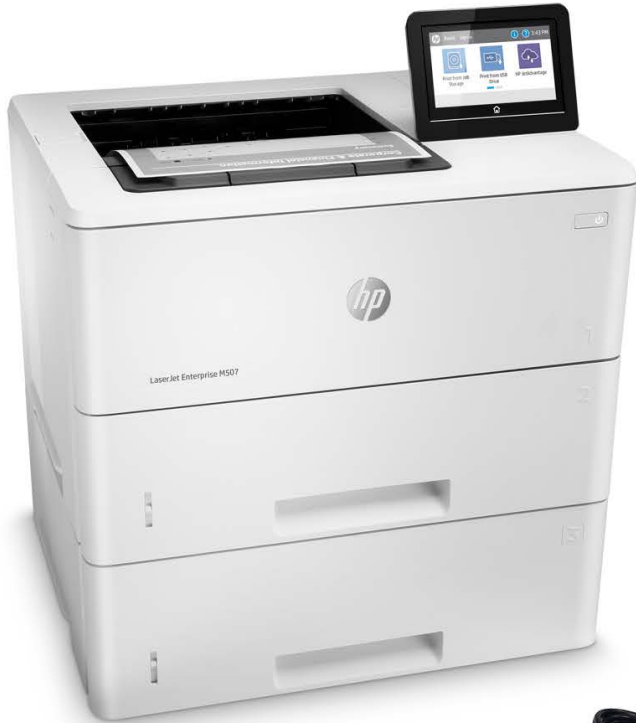
HP LaserJet Enterprise M507x