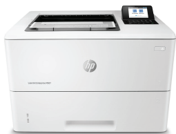
HP LaserJet Enterprise M507dn

Dynamic security enabled printer. Only intended to be used with cartridges using an HP original chip. Cartridges using a non-HP chip may not work, and those that work today may not work in the future. http://www.hp.com/go/learnaboutsupplies