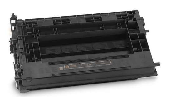
HP 37A Black LaserJet Toner Cartridge