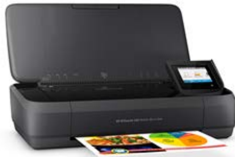
HP OfficeJet 250 Mobile All-in-One