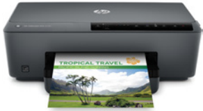
HP Officejet Pro 6230 ePrinter

The following table compares the new HP Officejet Pro 6230 ePrinter with the HP Officejet 6100 ePrinter.