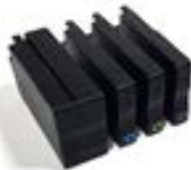
HP 934/935 Setup Ink Cartridges Black, Cyan, Magenta, Yellow