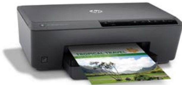
HP OfficeJet Pro 6230 Printer