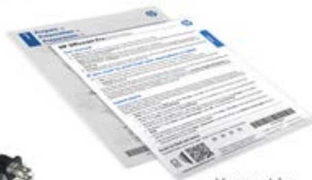
User guide Setup poster