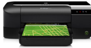
HP Officejet 6100 ePrinter